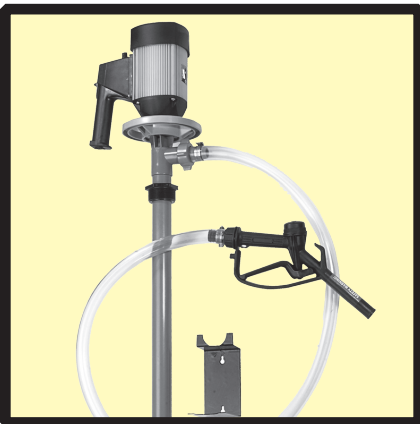
SERFILCO® Series 'DP' Drum Pumps