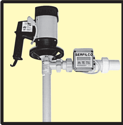
SERFILCO® Smart Drum Pump Batch and flow control systems.

SERFILCO® offers a complete product line of pumps for fast, safe and convenient transfer and dispensing of liquids.