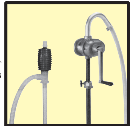
SERFILCO® Barrel and Container Pumps