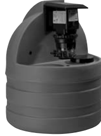
15-Gallon (56.8 Liters)