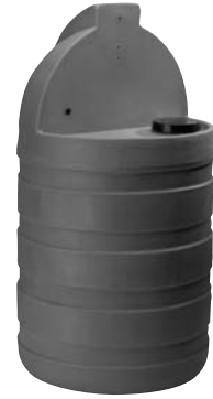
30-Gallon (113.6 Liters)