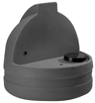
7.5-Gallon (28.4 Liters)