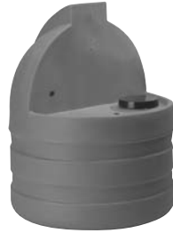
15-Gallon (56.8 Liters)