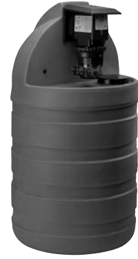
30-Gallon (113.6 Liters)