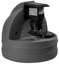
7.5-Gallon (28.4 Liters)